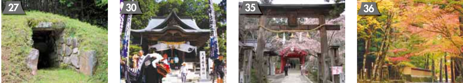
Kurotani Kofun (Burial Mound) (Hiroshima Prefecture Historical Site) (C-2) Dating from the late sixth to early seventh century, this round burial mound features a horizontal stone chamber with an open entrance facing southwest. It also houses a stone shelf—a rarity not seen in any other kofun in Hiroshima Prefecture. Kui-Inari Shrine (F-1) Built in 938, Kui-Inari Shrine is the oldest branch shrine of Fushimi Inari Taisha in all of Japan. The shrine's collection also houses "1570 Volumes of the Great Buddhist Canon Sutra Written in Ink on Paper," which were donated by Takakage Kobayakawa himself. Mitsuki-Hachimangu Shrine (G-3) It is said that Mitsuki-Hachimangu Shrine was founded in 769, when the Buddhist Nun Hokin was exiled to what is now Mihara, bringing the deity of Utsu-hachidango Shrine with her. The shrine is home to wooden komainu (guardian dogs) donated by none other than Yoshimasa Ashikaga, the eighth Shogun of the Muromachi Period. Buttsuji Temple (F-3) As the main temple of the Buttsuji branch of the Rinza Sect of Zen Buddhism, Buttsuji Temple is widely known as one of the most beautiful autumn leaves in all of Hiroshima Prefecture.