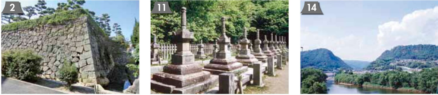
Funai (Boat) Turret Remnants (G-5) Long ago, Takakage Kobayakawa built Mihara Castle by connecting large and small islands on the Seto Inland Sea. Among the extant remains of the castle, the funai (boat turret) is a very important stone wall structure, as it best represents the castle's distinctive features as a castle on the sea. Beisanji Temple (E-5) Twenty Heijon Pagoda (pictured) stand in an orderly row on the grounds of Beisanji Temple, conjuring up images of bygone days as they silently mark the final resting place of generations of the Kobayakawa Clan—from the first feudal lord and patriarch, Sanheira, to the seventeenth, Takakage. Beisanji Temple's collection also houses a colored portrait of Takakage Kobayakawa on silk, which has been designated as a National Important Cultural Property. Takayama Castle & Ni-Takayama Castle Remnants (National Historic Site) (E-4) The remnants of the home castle of the feudal lord Takakage Kobayakawa, Takayama Castle sits on the east bank of the Nuta River while Ni-Takayama Castle can be seen just across the river on the west bank. As an excellent docking location for riverboats, Ni-Takayama Castle was a useful base for the activities of Motonari Mori's naval forces.