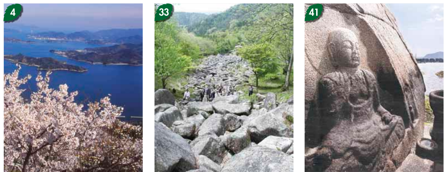
Setonaikai National Park Mt. Fudekage / Mt. Ryuo (F-5, G-5) The sight of some 2,000 sakura (cherry trees) in full bloom in the spring is an overwhelming treat for the eyes. Mt. Fudekage and the adjacent Mt. Ryuo are widely known for providing some of the absolute best views of the Seto Inland Sea and, especially, the view overlooking the lovely islands of the Seto Inland Sea with blossoming cherry blossoms in the foreground is definitely worth seeing at least once in a lifetime. Kui Block Field (National Natural Monument) (G-1) At the foot of Mt. Une, the highest peak (638.9m above sea level) in the Binan Region, sits one of Japan's largest block fields. Large (1 – 7m in diameter) and unusually shaped rocks pile up as they flow like rivers down through three gently sloping valleys at the foot of the mountain, creating scenery that is at once peculiar and magnificent. Saint Jizo Carved Rock Relief Image (Hiroshima Prefecture Important Cultural Property) (E-5) At high tide, this unusual statue of Saint Jizo is submerged up to its shoulders. Painstakingly carved into the rock surface facing the sea, this image of the seated Saint Jizo is said to have been carved by the master Buddhist sculptor Nenshin at the request of a local temple in the year 1300. Even today, the extremely refined carving work is still clearly visible.