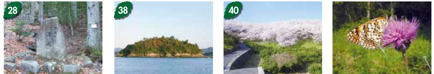
Ashida River Source (C-1) The surrounding area is also the cradle of several of the major rivers in Hiroshima Prefecture, including the Ashida River, the Gono River and the Nuta River. There is great demand for far and wide for natural mineral water made using the spring water that originates here. Sukunajima Island (G-5) Sukunajima Island was the setting for the 1960 movie "The Naked Island," directed by the late, great master of Japanese Cinema, Kaneto Shindo. Later, Shindo would scatter a part of the ashes of his late wife, the actress Nobuko Ohta, in the sea around the island in remembrance of her performance in the film. Tonomine Thousand Sakura (cherry trees) (G-5) This is the best site to view the sakura (cherry trees) on all of Sagishima Island. Over 1,000 sakura cover the face of a small mountain (Tonomine). When the cherry blossoms are in full bloom, one can see a "tunnel of sakura" in the form of the road that encircles Tonomine. Melitaea Scotosia This butterfly has actually been designated by the Ministry of the Environment as "one of the most highly endangered organisms" and can now only be found within Hiroshima Prefecture, making it a truly precious creature.