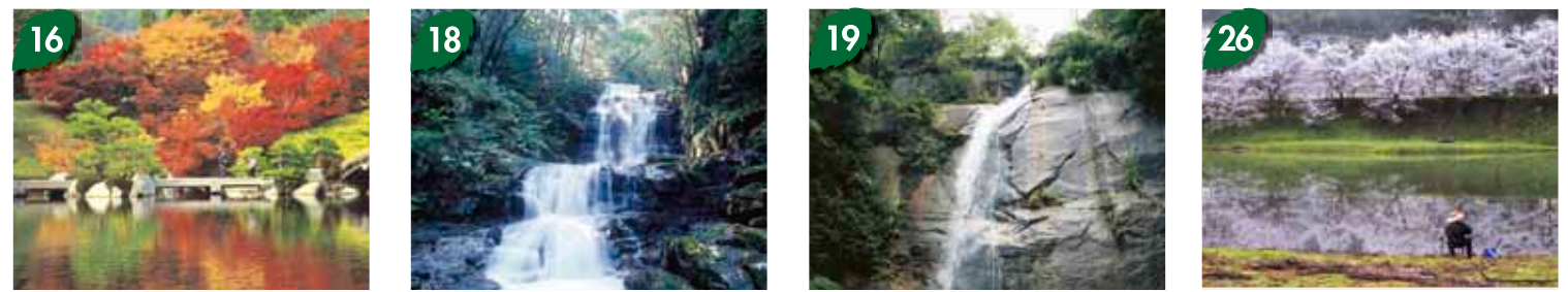
Sankeien Garden (D-4) The motif of this traditional Japanese garden is the three types of scenery that best represent Hiroshima Prefecture: Village, Mountain and Sea. With highlights including a three-step waterfall and Chikentei, a tea-house built in the sukiya style according to Fong Shui principles, Sankeien Garden also attracts visitors with the beauty of its trees and flowers throughout the four seasons. Jo'o no Taki Waterfall (D-3) Jo'o no Taki Waterfall was featured as the title background during the opening credits of the NHK Taiga Historical Drama about Motonari Mori. The area around the waterfall is also a hiking course that is popular for its beautiful natural surroundings. Bakusetsu no Taki Waterfall (D-3) Also known as "Seishinji no Taki Waterfall," this 30m waterfall is an upstream part of the Nuta River. On the west side of the river, there is a large Zen Meditation Rock that is said to have been used as part of the ascetic training of the Busho Zenji, the founder of Enryakuji Temple. Lake Hakuryoku (C-2) The shores of Lake Hakuryoku are lined with sakura (cherry trees), so that the cherry blossoms in full bloom can be seen reflected in the tranquil surface of the water. During the cherry blossom viewing season, the lake is also lit up at night, making it a perfect place for nighttime cherry blossom viewing as well.