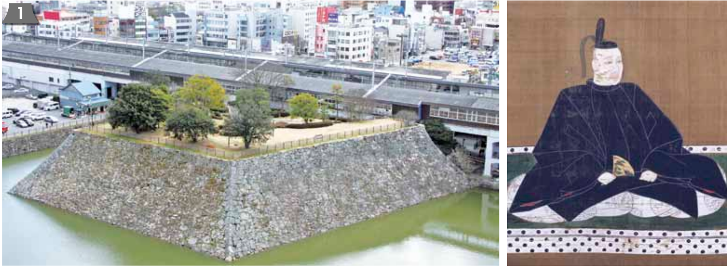
Mihara Castle Remnants (National Historic Site) (G-4) Built by Takakage Kobayakawa, the third son of Motonari Mori (a samurai general of the Warring States Period made famous in the parable "The Lesson of the Three Arrows"), in 1567, Mihara Castle was constructed by connecting several small islands on the Seto Inland Sea. This gives the castle the appearance of floating on the sea, earning it the nickname "Ukishiro" (Floating Castle). It is said that when the great Hideyoshi Toyotomi and Ieyasu Tokugawa stayed in Mihara, they were struck with wonder at the marvelous layout of the castle. Today, one can still see the remains of the castle walls and moat as well as the teshudai (castle keep), the funai (boat turret) and the central gate of the honmaru (castle keep). [Image at Right: Colored Portrait of Takakage Kobayakawa on Silk (Beisanji Temple Collection)]