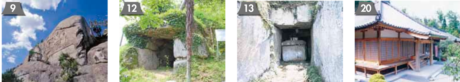
Ryusenji Temple Carved Rock Relief Image of the Buddha on Mt. Shirataki (E-4) While atop the peak of Mt. Shirataki, Ryusenji Temple is said to have been founded by the Buddhist Priest Gyoki. The first thing to catch your eye upon entering the temple grounds is sure to be the image of the Buddha flanked by two Bodhisattvas, painstakingly carved into the rock of a sheer cliff. One can clearly see the seated Buddha (Gardener) and his two standing attendants, the Bodhisattvas Kasyapa and Ananda, who are all three riding atop clouds. Baikihira Kofun (Burial Mound) (Hiroshima Prefecture Historical Site) (E-4) Baikihira Kofun is known as the largest "horizontal" stone chamber burial mound in Hiroshima Prefecture. There are numerous other kofun scattered around the same area, suggesting that people settled here in ancient times and have been living on this fertile land for millennia. Mitoshiro Kofun (Burial Mound) (Hiroshima Prefecture Historical Site) (D-4) Said to have been built around the end of the Kofun Period, this kofun features an open entrance facing south and is divided into two separate chambers—a fore chamber and a rear chamber—making it a rarity among all of the kofun in Japan. The stone polishing techniques used to create its highly refined sarcophagi are also among the finest examples known in all of Japan. Seishinji Temple & Seishinji Park on Mt. Okai (D-3) Established by Sanheira Dohi and his son, Tohira, this ancient temple has a strong association with the Kobayakawa Clan. The temple's collection houses statues of the Twenty-Eight Attendants of Senju-Kannon (Buddhist Goddess of Mercy) with 1,000 Arms, which are collectively a designated important cultural property of Hiroshima Prefecture.